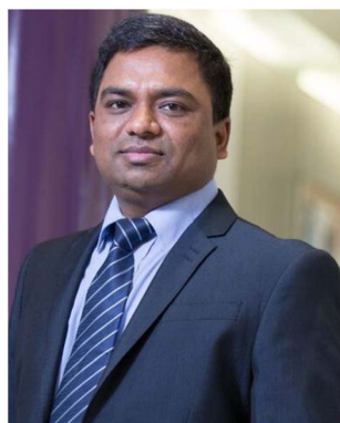
Navin Kumar Verma

agents, such as iodinated compounds and gadolinium-based agents, have long been used to enhance anatomical imaging by altering the physical properties of tissues. 4,5 While conventionally synthesized contrast agents have enabled high-contrast imaging at the macro level, achieving micro-level imaging required for visualizing dynamic behaviors and specific cellular functions still remains challenging. In recent years, stimuli-responsive nanoprobes capable of activating their imaging signals only in specific tumor microenvironments, such as acidic pH or hypoxic regions, have gained significant interest for improving signal-to-noise ratios and minimizing off-target effects. 6,7 Magnetic particle imaging has also emerged as an excellent modality exploiting the superparamagnetic properties of iron oxide NPs offering radiation-free and highly sensitive detection for quantitative theranostic applications. 8 Other than this, hybrid nanoplatforms integrating organic, inorganic, and biological components have also played a significant role in offering multifunctionality for simultaneous multimodal imaging and combinatorial therapies. 9 Genetically engineered and endogenously produced contrast agents have surpassed