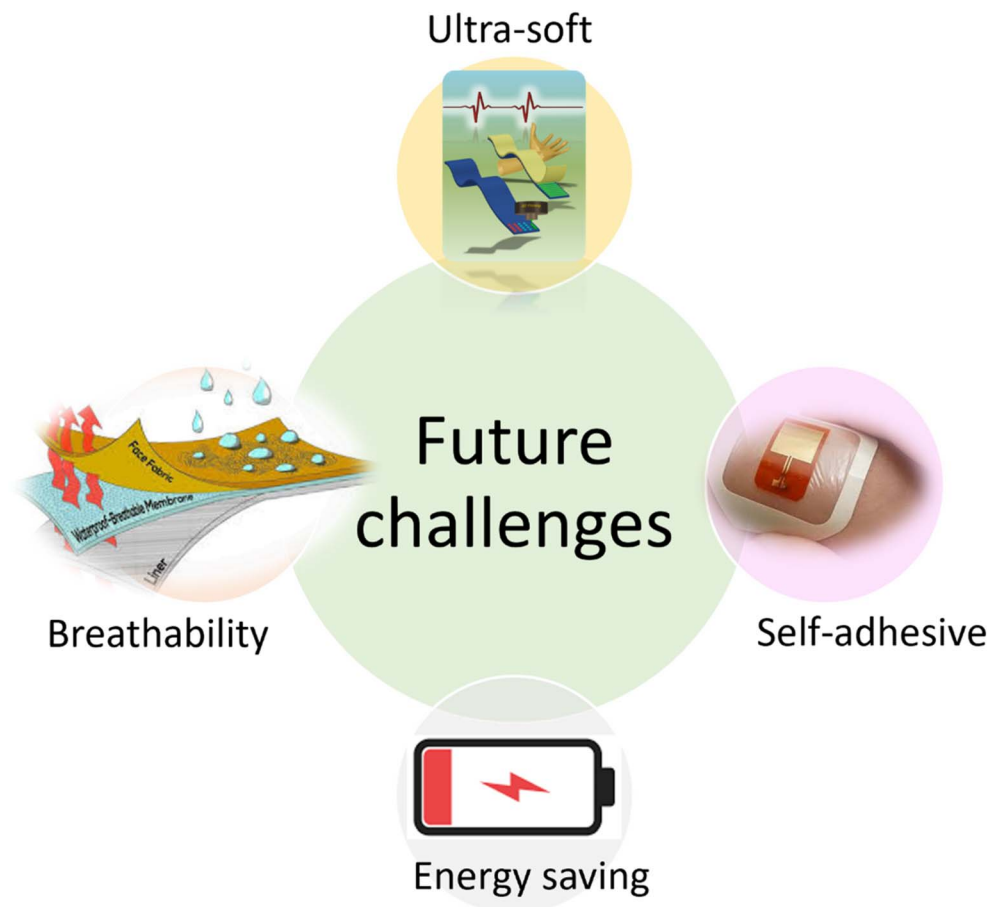
Fig. 9 Trends: future Challenges in various prospects.