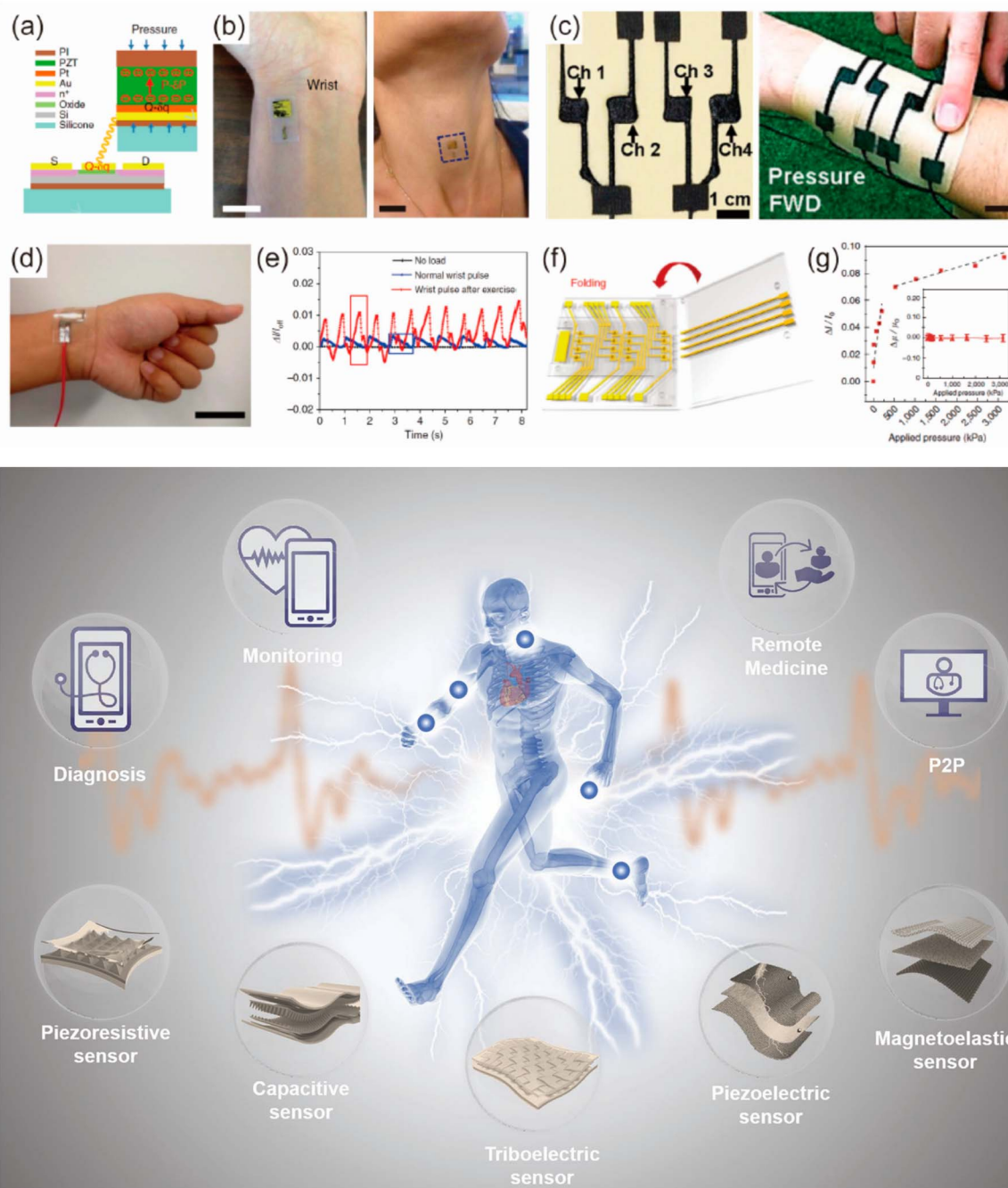
Fig. 4 Wearable pressure-sensing gadgets. (a) A schematic diagram of the cross-section of the pressure sensor and its contacts in an accompanying transistor. (b) The pressure sensor is positioned on the wrist and neck to measure instantaneous variations in blood pressure. Produced with copyright permission from MDPI, Polymer. 69 (c) A printed pressure sensor is mounted on a commercially available elastomeric patch. (d) The skin-mounted sensor is positioned directly above the wrist artery (at a scale bar of 3 cm). (e) The heartbeat is measured by sensing the physical force under healthy and exercising conditions. (f) A representative picture of pressure-sensitive graphene FETs (g) A plot of changes in normalized drain current versus pressure applied to the device. Wearable pressure sensors for monitoring human health. By integrating biomechanical devices with artificial intelligence, including active materials, functional structures, wireless transmission technology, and big data analysis, convenient and biocompatible assessment of the cardiovascular system can be achieved. Such an intelligent platform provides personalized healthcare and therapy to individuals while maintaining user comfort, superior sensitivity, long life, ease of use, and mechanical durability. Reproduced from ref. 31 and 74. With permission from [Royal Society of Chemistry], copyright [2023] & Wiley 2022.

high sensitivity ( \sim 0.1/2 Pa) and a rapid reaction time (0.1 ms). It may be softly connected to the neck or wrist to display blood pressure 69,70 (Fig. 4b).