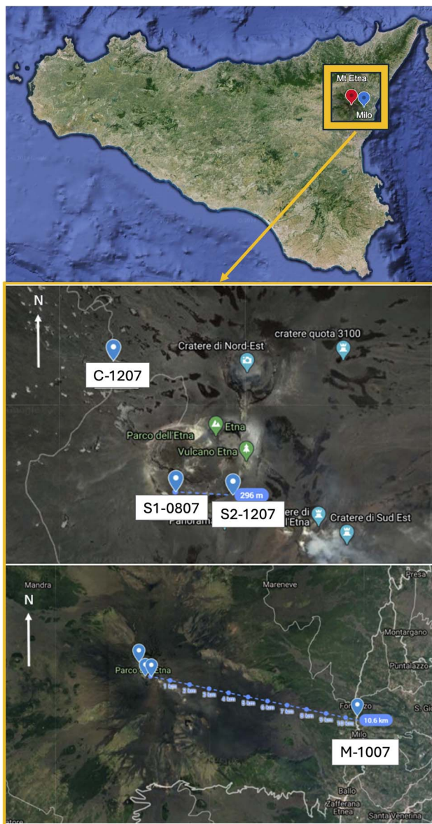
Fig. 1 Map of Sicily (top panel), filter sampling locations at the summit of Mt. Etna (middle panel) within (S1-0807 and S2-1207 sets) and upwind (C-1207 set) of the plume and filter sampling locations in the town of Milo (bottom panel) downwind of the plume (M-1007 set). The Mt. Etna summit is located at 37.7510° N, 14.9934° E and has an altitude of 3369 m.