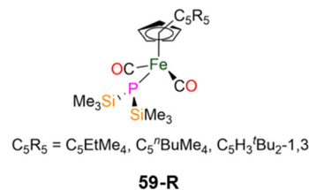
Fig. 17 Group 8 \text{P}'' complexes [\text{Fe}(\text{C}_5\text{R}_5)(\text{CO})_2(\text{P}'')] ( 59-R ; \text{C}_5\text{R}_5 = \text{C}_5\text{EtMe}_4 , 59-EtMe 4 ; \text{C}_5^n\text{BuMe}_4 , 59- n BuMe 4 ; \text{C}_5\text{H}_3^t\text{Bu}_2\text{-1,3} , 59-1,3- t Bu 2 H 3 ).

In 1992, Weber reported the synthesis of a series of Cp-substituted Fe(II) \text{P}'' complexes [\text{Fe}(\text{C}_5\text{R}_5)(\text{CO})_2(\text{P}'')] ( 59-R ; \text{C}_5\text{R}_5 = \text{C}_5\text{EtMe}_4 , 59-EtMe 4 ; \text{C}_5^n\text{BuMe}_4 , 59- n BuMe 4 ; \text{C}_5\text{H}_3^t\text{Bu}_2\text{-1,3} , 59-1,3- t Bu 2 H 3 , Fig. 17) by the separate salt metathesis reactions of the parent monobromide complexes, [\text{Fe}(\text{C}_5\text{R}_5)(\text{CO})_2(\text{Br})] ( \text{R}_5 = \text{EtMe}_4 , n BuMe 4 , 1,3- t Bu 2 H 3 ) with \text{LiP}'' . 99f The syntheses of three analogous Ru(II) \text{P}'' complexes [\text{Ru}(\text{C}_5\text{R}_5)(\text{CO})_2(\text{P}'')] ( \text{R}_5 = 1,2,4\text{-}^i\text{Pr}_3\text{H}_2 , 1,3- t Bu 2 H 3 , 1,3-(SiMe 3 ) 2 H 3 ) were reported by Weber in 1994 but again these complexes were not structurally authenticated. 99g We note that only 59-EtMe 4 was structurally