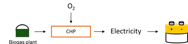
Fig. 1 Schematic representation of combined heat and power (CHP) production: independently from renewable energy availability, biogas is combusted to produce electricity.

The capital cost is accounted for as follows: