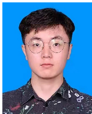
Ze Qiang Zhao

At the same time, encouraged by cytokines, fibroblasts, keratinocytes, and endothelial cells multiply and differentiate to generate light pink granulation tissue to provide a framework for extracellular matrix (ECM), blood vessels, and inflammatory cells. 22,23 At the same time, basal cells from the faulty tissue migrate to the wound surface to multiply in huge numbers to eventually form epithelial cells in re-epithelialization. 24 Subsequently, the remodeling phase of wound healing