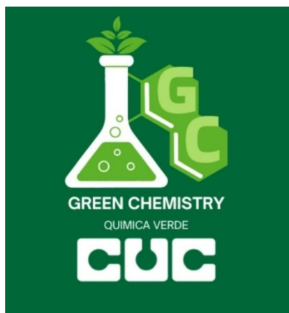
Fig. 3 Green chemistry research seedbed logo.

and practical settings, including the development of natural pH indicators, alternative disinfectants for drinking water treatment, and the valorization of agricultural waste for contaminant removal. In 2017, the first undergraduate project of the Research Seedbed in green chemistry was successfully completed. This project involved the extraction of anthocyanins from red cabbage ( Brassica oleracea ) as a natural substitute for synthetic pH indicators. This initiative is in alignment with the principles of green chemistry, specifically the first, fourth, and tenth principles. The natural indicator exhibited analytical performance analogous to that of conventional indicators, while concurrently effectuating a substantial reduction in hazardous waste generation. 49 Another study assessed peracetic acid as an alternative disinfectant for drinking water treatment, showing comparable efficiency to sodium hypochlorite while producing fewer harmful by products and complying with Colombian drinking water regulations. 50