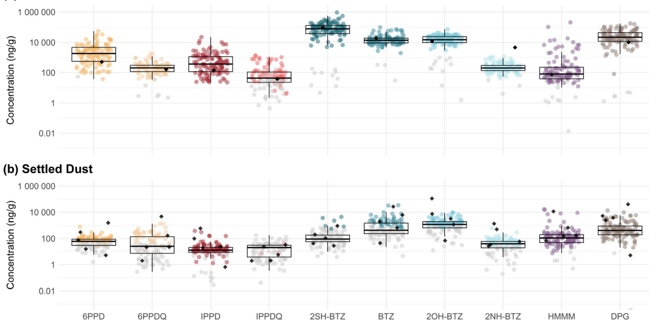
Fig. 2 Concentrations of rubber-derived compounds in (a) foothold powder and (b) settled dust. Gray color indicates <LOQ values (for the respective batch) which were substituted by random numbers between 0 and the (respective batch) LOQ for statistical analyses, see Section 2.3. Due to LOQs varying between batches some compounds may have substituted values higher than some measured values. Outlier values that are removed before analysis are displayed in black.

ubiquity in indoor climbing halls. Fig. 2 shows the concentrations of RDCs in both foothold powder and settled dust, with randomly substituted values below the respective batch LOQ (see Section 2.3) in gray. Due to LOQs varying between batches some compounds may have substituted values higher than some measured values.