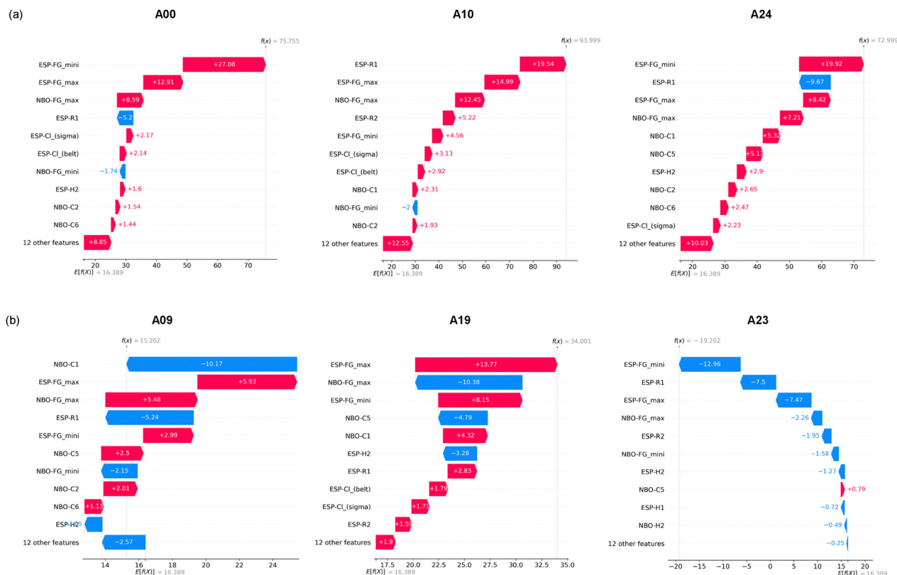
Fig. 6 SHAP waterfall plots illustrating contributions of individual descriptors to the yield of product 2a . (a) Representative effective additives: A00 , A10 , and A24 , where functional-group descriptors (ESP-FG mini, ESP-FG max, and NBO-FG max) make strong positive contributions. (b) Representative ineffective additives: A09 , A19 , and A23 , where descriptors associated with the functional group or the aromatic ring exhibit strong negative contributions.

functional-group descriptors were counteracted by negative contributions from NBO-FG max and aromatic descriptors. For A23 , ESP-FG mini, ESP-FG max, and ESP-R1 all contributed strongly in the negative direction, indicating that both the functional group and aromatic ring were electronically unfavorable. These results are consistent with the finding from the beeswarm plot that excessive negative or positive charges at the functional group can decrease yield. This supports the scenario in which in situ generated Mg species react with the additive rather than participating in the intended halogenation.