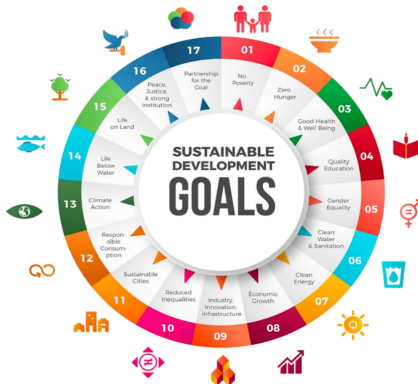
Fig. 1 Sustainable development goals declared by the United Nations.

may be exhausted within 50–60 years, emphasizing the urgent need to transition to alternative energy sources. 6 Any alternative fuel must avoid the environmental drawbacks associated with carbon-based fuels. In this context, hydrogen has been widely recognized by researchers as a promising solution to address energy-related environmental challenges, offering a pathway towards sustainable energy and a greener planet. Hydrogen is considered a promising “carbon-neutral” energy carrier. 7 The oxygen can be released into the atmosphere, while the hydrogen is stored for future use, where it is oxidized to release energy and form water again. 8,9 Hydrogen possesses several notable benefits, such as low toxicity, safe transportation over long distances through pipelines, and a high energy density per unit mass, which is roughly three times greater than that of gasoline. 10,11