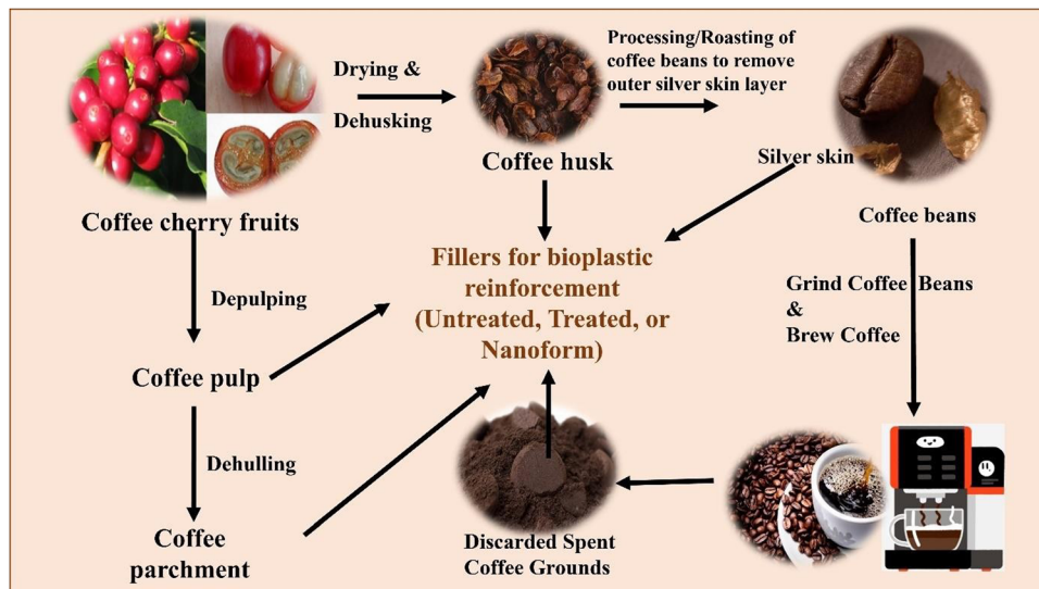
Fig. 8 Various coffee processing byproducts in the production of fillers [image created by the first author, Zeba Tabassum, utilizing data from ref. 55–58].

Fourier-transform infrared spectroscopy results confirmed the successful integration of coffee waste into the film matrix, as evidenced by the presence of an N–H bond. Incorporating coffee filler also improved the film's hydrophobicity, as indicated by an increased water contact angle compared to the neat film. The tensile properties of the biopolymer film were notably enhanced with the addition of 4 wt% coffee powder, achieving an optimum tensile strength of 35.47 MPa. The inclusion of coffee waste in the seaweed matrix resulted in improved functional properties of the fabricated biopolymer film. Therefore, the researchers concluded that the seaweed/coffee biopolymer film has the potential for use in food packaging and various other applications. 60