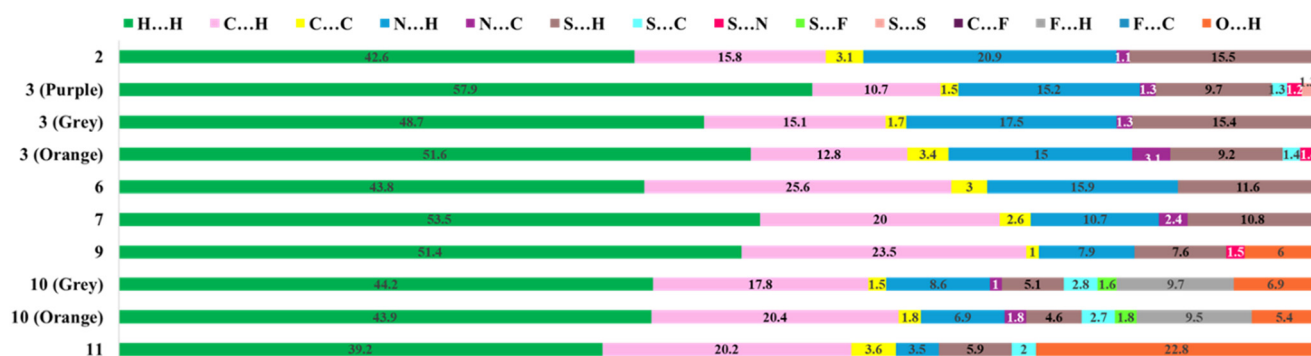
Fig. 13 The relative percentage contribution of various contacts based on 2D fingerprint plots present in all eight compounds.

In contrast, substituting the amine group with an amide in compounds 9 and 10 results in N–H \cdots O hydrogen bonds