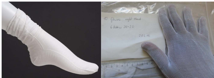
Fig. 10 Images of a sample repellent sock and glove made from porous polymeric materials. Reproduced from ref. 97 with permission from Elsevier, copyright 2018.