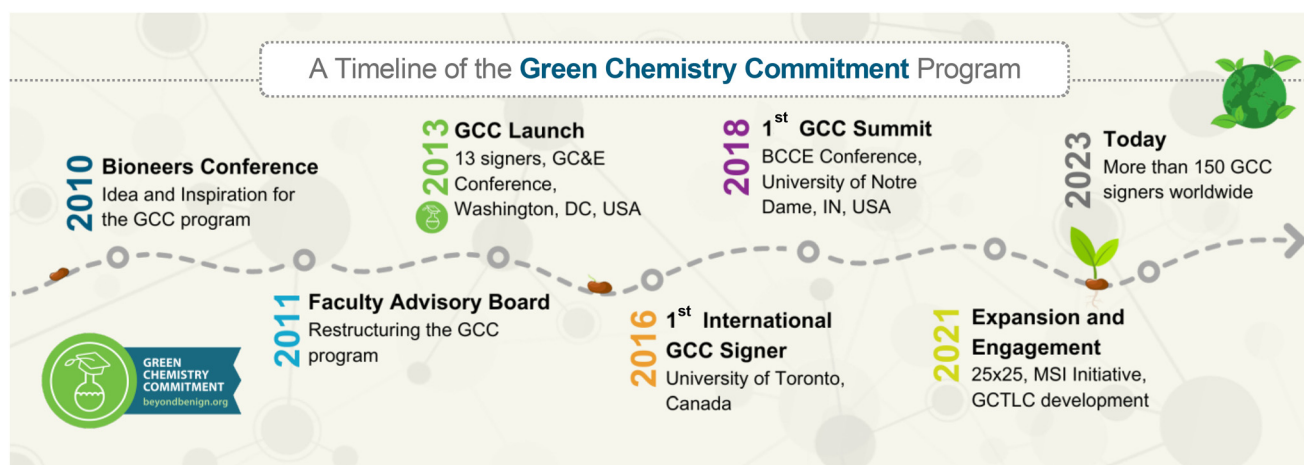
Fig. 1 A timeline of the Green Chemistry Commitment (GCC) program, which is composed of more than 150 higher education institutions worldwide as of December 31, 2023.

For the 25 × 25 Initiative, a combined total of $55 000 USD (37% of total GCC grant funding) has been awarded to 8 institutions in the U.S. to drive awareness and improve the adoption of green chemistry locally and internationally, and these numbers continue to grow. 34–36 The first Green Chemistry Challenge Award winners ( i.e. , Michigan State University; University of California, Berkeley; Southern University and Agricultural & Mechanical College) proposed the design of more than 10 teaching resources, thus helping to bring green