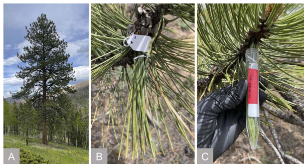
Fig. 1 Ponderosa pine specimen from sampling at the CSU Mountain Campus on June 19, 2023 (A). In a typical soak, healthy needles growing in proximity were bundled together (B) and soaked for 5 min in 10 mL of MilliQ water in a pre-leached falcon tube (C).

cotton string (Fig. 1B). The bundle was then soaked for 5 min in a pre-leached falcon tube containing 10 mL of MilliQ water (Fig. 1C). Variations of this protocol allowed us to investigate the effect of specific sampling variables – e.g. , we modified the number of needles from 5 to 20, the soaking time from 5 seconds to 1 hour, and used natural rain instead of MilliQ water as the solvent (details in ESI†). In addition to soaks, we collected authentic raindrops during three rain events (Text S2 and Table S2†). In all cases, we handled needles with gloves to minimize contamination.