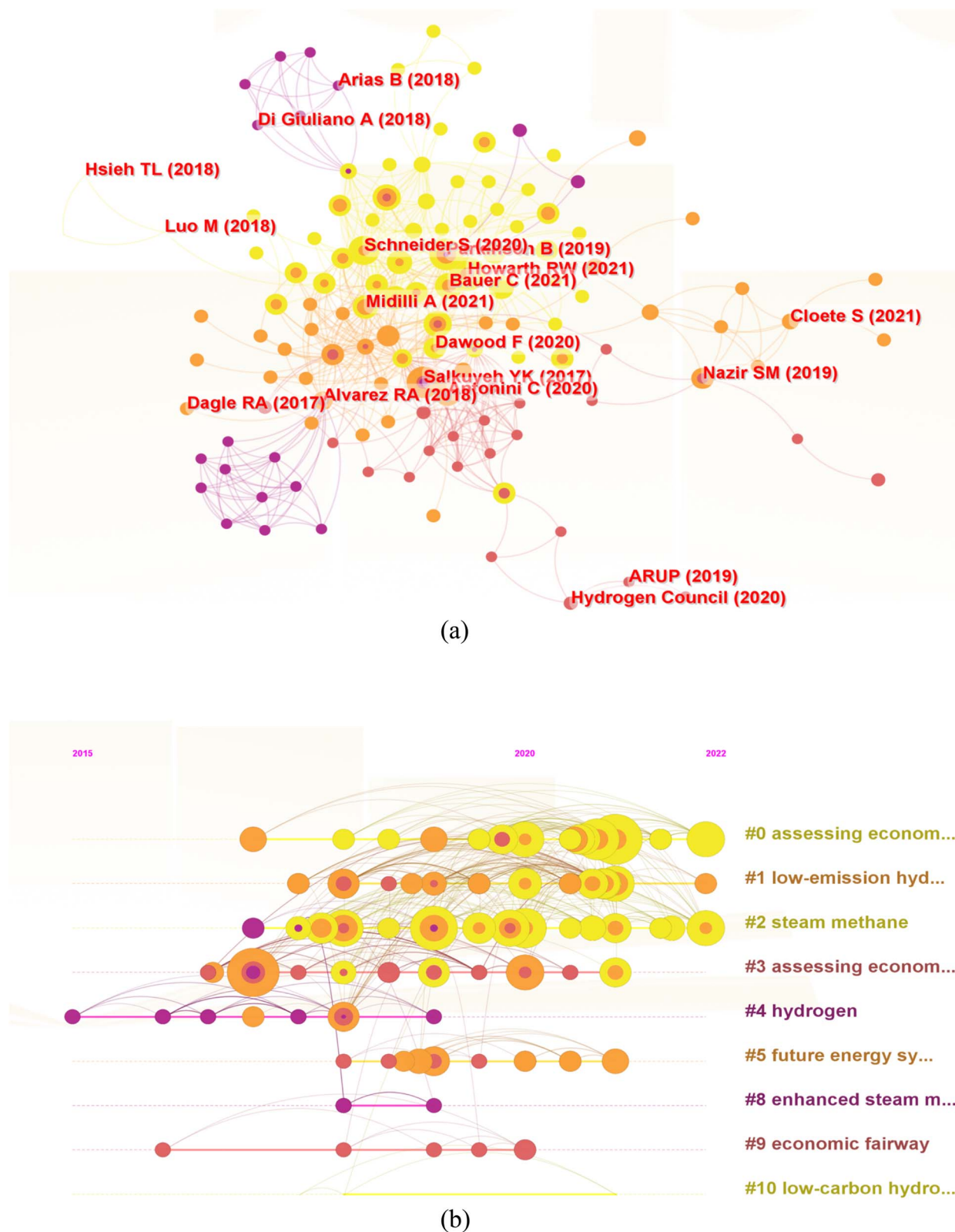
Fig. 8 (A) Cluster view of co-citation references. (B) The clusters are arranged in a vertical hierarchy, descending in order of size. The temporal evolution is delineated by differently coloured lines, where nodes along the lines denote cited references and links represent co-cited references. The varying node density at distinct temporal intervals indicates the dynamic alterations within the corresponding clusters along the temporal axis.