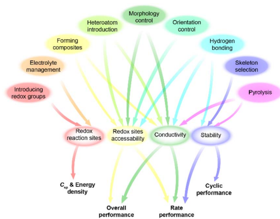
Scheme 2 Relationship between strategies and device performance.

provide improved stability. The high temperature treatment of COFs generates heteroatom-doped carbon materials with a mixture of conjugated and nonconjugated backbone.