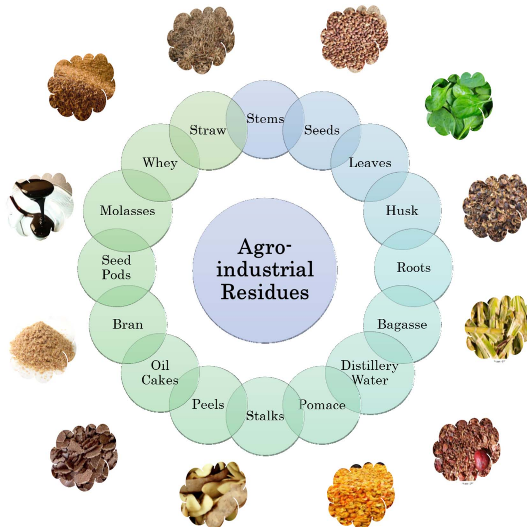
Fig. 4 Different agro-industrial residues used as substrate during biosurfactant production.

5.1.1. Vegetable oil and (oil) wastes. A large amount of waste residues formation occurs during the oil extraction in various oil industry. These left over products includes oil cakes, oil soap stocks, by-products rich in fat content, semisolid and water soluble effluents, fatty acid residues etc. 64