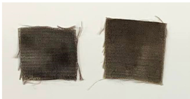
Fig. 7 Stained Kevlar sample before (left) and after (right) simulated laundering.

simulated laundering procedure based on an international standard procedure. 37 The dyed Kevlar sample was subjected to an aqueous detergent mixture at elevated temperature