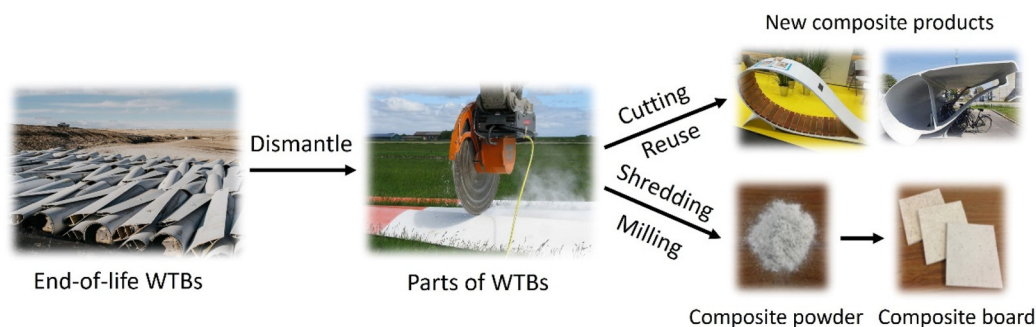
Fig. 4 Mechanical recycling processes of end-of-life WTBs.