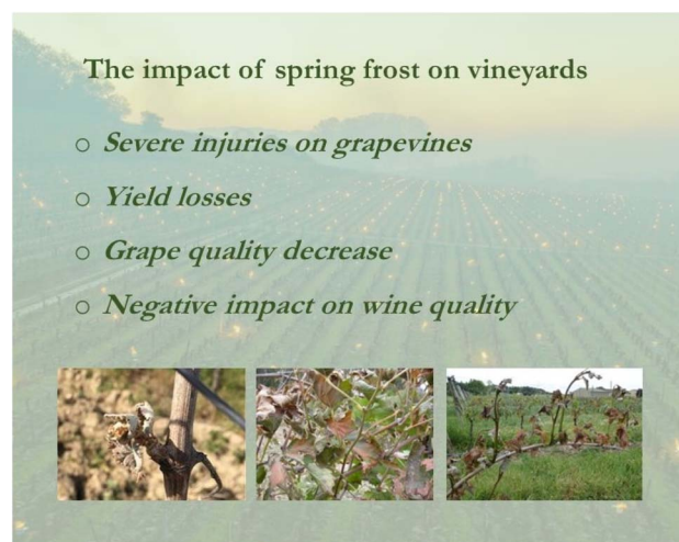
Fig. 1 The impact of spring frost on vineyards.

Late in the plant development, after the grapes have formed, frozen grapes may contain high concentrations of sugars and sustain aromatic and flavor compounds, contributing to wine