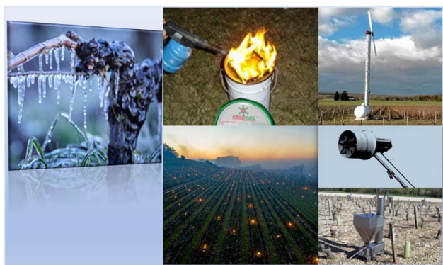
Fig. 2 Implementing active frost control techniques in vineyards (figure from the area of Saint-Émilion, Union of Producers, France https://vins-saint-emilion.com ).

The platform follows a bottom-up approach and comprises four building blocks: (a) decentralized data and in situ processing tools enable the capture and processing of data close to the sources. It integrates data from diverse sources such as in situ (IoT) sensors, RGB and multispectral images from drones, and Earth Observation data (EODATA/EODATA+) from Copernicus Sentinels, Landsat, and Envisat. (b) edge cloud analytics suite utilizes network edge processing and storage capabilities for efficient distributed processing and edge-driven Federated Machine Learning (ML). Explainable AI (XAI) justification is employed to enhance the end-user experience and foster trust in platform