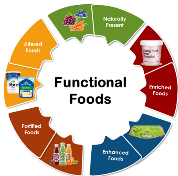
Fig. 1 Categorization of functional foods.

Over the last few years, polyphenols have attracted increasing interest due to their numerous bioactive and health-promoting properties, such as antioxidant, antimicrobial, and anti-inflammatory, 1 and thus are considered excellent candidates as bioactives in health-promoting and disease-preventing functional foods.