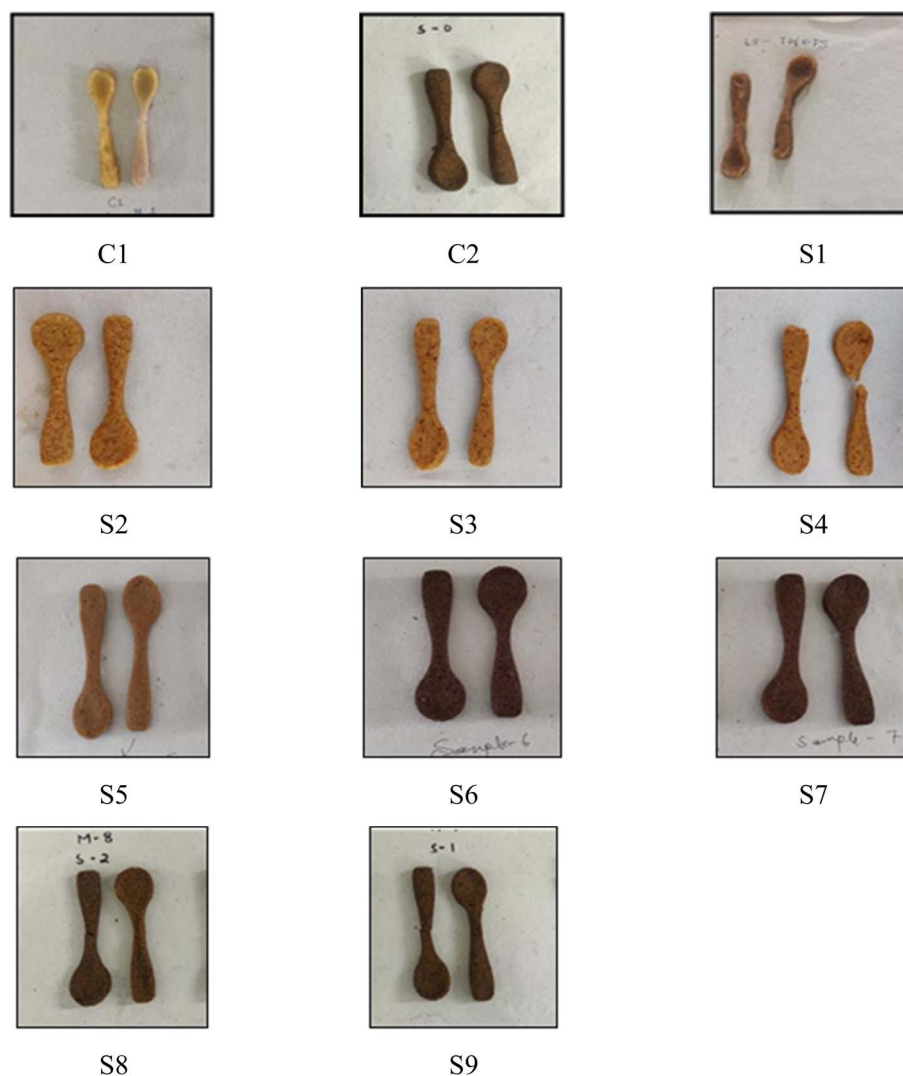
Fig. 2 Developed edible spoons.

where w_1 = weight of the empty flask (g), w_2 = weight of the flask and extracted fat (g) S = weight of the sample.