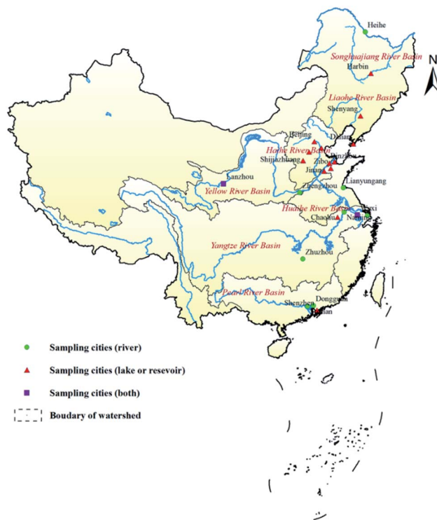
Fig. 1 Location of sampling cities in seven major river basins in China.

2.1.3 Experimental reagents and chemicals. A MC-LR standard product obtained from Taiwan Algae Research Co., Ltd. was used. The MC-LR standard solution was made up to a 20 \mu\text{g mL}^{-1} stock solution with methanol and stored at -4 °C. The solid phase extraction column was obtained from Waters Oasis® HLB.DC HP (20 \mu\text{m} , 2.1 mm \times 30 mm, reusable), and disposable needle filters (25 mm) were purchased from Acrodisc GHP 0.2 \mu\text{m} (Pull, USA).