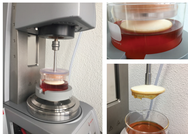
Fig. 2 Image of the used ISR setup with close-up of the custom made bicone at the air/tea interface and attached biofilm after 9 days of kombucha biofilm growth.

The formation of kombucha biofilms was measured for 7 days by transient ISR time sweeps, i.e. sinusoidal oscillation of the bicone at constant frequency of 1 rad s -1 and strain amplitude of 0.5%. In separate experiments, frequency sweeps of the formed kombucha biofilms were performed every 24 h for 7 days by ranging the oscillation frequency from 0.1–100 rad s -1