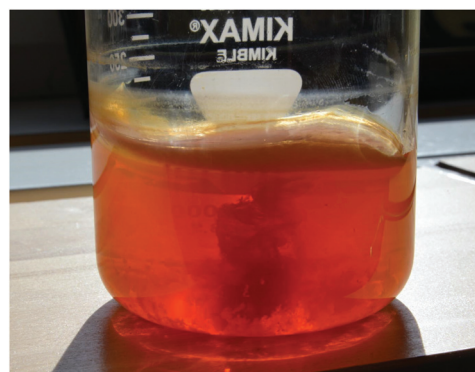
Fig. 1 Kombucha after four weeks of fermentation with characteristic cellulosic biofilm.

acid. The most prominent bacterium is Acetobacter xylinum , which was reclassified as Komagataeibacter xylinus in 2012. 1,5–7 K. xylinus is best known for its ability to produce bacterial cellulose. The bacteria excrete 2–4 nm thick cellulose nanofibrils from their membrane which assemble into larger macrofibrils, and ultimately form the 3D cellulosic biofilm typical for kombucha. 8–11 Bacterial cellulose is valued in material sciences due to its high purity and degree of crystallinity, and kombucha biofilms are thus increasingly considered as renewable raw material for bioadsorbents, packaging materials, or biomedical applications. 12