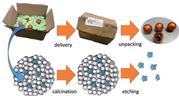
Fig. 1 Similar to foam peanuts, which are used as protectant against mechanical damage in the packaging of fragile products, SiO 2 NPs protect sinter-labile NPs within a supraparticle during calcination.

The obtained supraparticles resemble raspberries in their structure 28 and allow the calcination of the desired NP type. After calcination of the supraparticles, the (non-silica) NPs are regained as monodisperse sol via dissolution of the silica components in a strong base. Fig. 1 depicts the principle of this fabrication route using silica NPs as protectant against sintering, which is similar to foam peanuts as protectant against mechanical damage in the packaging of fragile products. However, it should be noted here that a difference between using foam peanuts for transport (as well as the mentioned approaches of embedding NPs in a gel or a salt matrix) and the herein proposed method is the formation of supraparticles instead of simply mixing both nanoparticles types. This brings the advantage of providing a free flowing micropowder sample after calcination (Fig. S1 in the ESI†) and thus, faster dissolution of the silica components due to a better accessibility compared to bulk material.