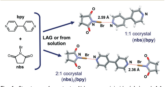
Fig. 1 Structures of reactants, N -bromosuccinimide ( nbs ) and 4,4-bipyridine ( bpy ), and the cocrystal structures obtained as a result of the single crystal X-ray diffraction experiment.

In order to explore the stoichiometric ratio of nbs and bpy as well as the reactivity in the solid state, we first attempted the mechanochemical synthesis of the cocrystals by NG and LAG of nbs with bpy in the stoichiometric ratios 1:1 and 2:1,